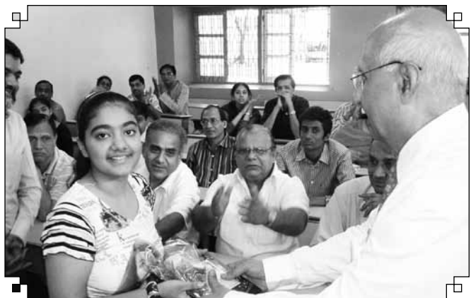
Student Felicited at Saraswati Sanman Samarambh.